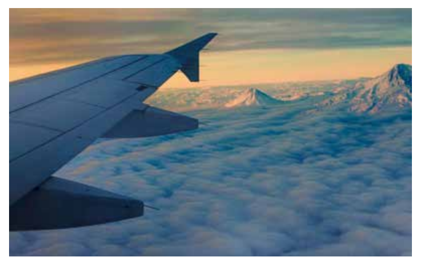
ATM must serve the needs of the users, and continue to be a safe and efficient movement from departure to arrival.

While air transport has enviable accident rates, the fact remains that if the accident rate does not fall as traffic rises then the number of accidents and casualties will increase. Therefore, a proportional improvement in safety levels must be sought if the risk to the travelling public is to be avoided. Accordingly, safety enhancement is the most important performance parameter in any air navigation system and as such, should never