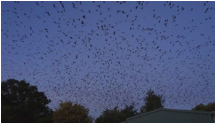
Flying Fox 'fly out'

The “good news” is that bats are reasonably predictable in their behaviour and tend to leave (“fly out”) and return (“fly in”) to their camps around the same time period each day. During these periods of movement, there can be a considerable number of animals in the air.