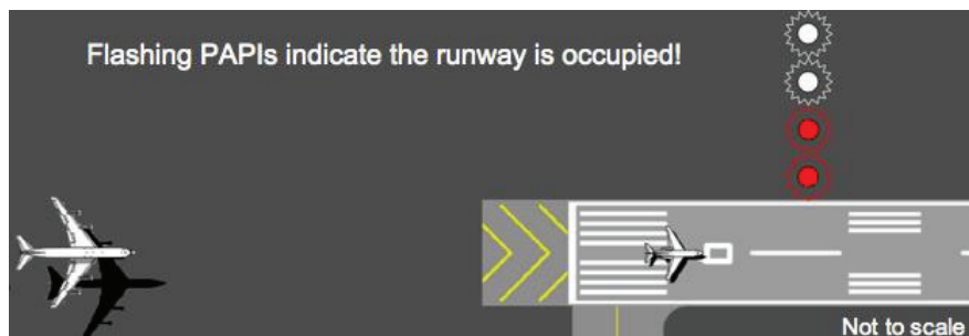
Figure 1. Final Approach Runway Occupancy Signal (eFAROS)

The Enhanced Final Approach Runway Occupancy Signal (eFAROS) has been installed at BOS to reduce the frequency and severity of runway incursions. eFAROS directly indicates to pilots on final approach that the runway is occupied and unsafe for landing by flashing the Precision Approach Path Indicator (PAPI) lights. eFAROS is a fully autonomous, surveillance-driven system not controlled by ATC and indicates runway occupancy status only, never clearance.